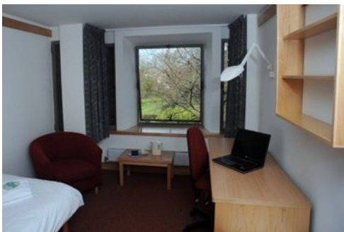
Single ensuite room in Blundell Court

Monday – Saturday 7.30am – 9.00am Sunday 8.30am – 10.00am