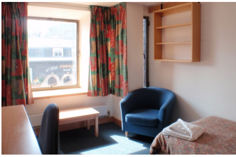
Ensuite room in Blundell Court