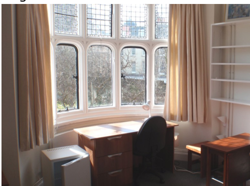
Standard room in Cloister Court

Internet access may also be possible using a computer provided by the College for guests' use. Please contact the Porters' Lodge or Conference Office if this facility is required.